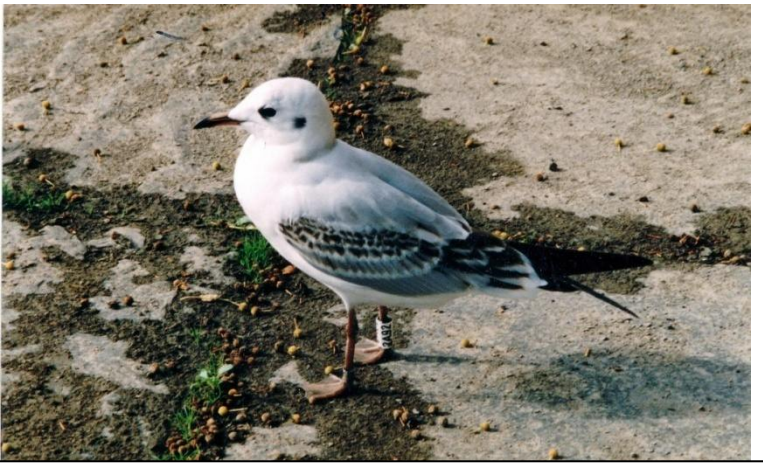
A young Black Headed Gull - 2A92 - which was ringed June 2004 at Lake 9 as a chick and sighted in Cheshire September 2004

• Can the numbers breeding be increased by providing more artificial nest sites?