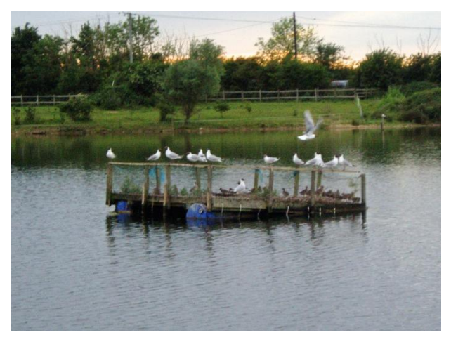
Lake 74 – Cleveland Farm

A large lake with no natural islands and little vegetation. Prior to the study nesting rafts were provided for breeding gulls and terns. Traditionally the first was positioned in March for BHGs and the second in late April for Common Terns. In 2006 the number of rafts was increased to 4 with 2 early rafts and two later.